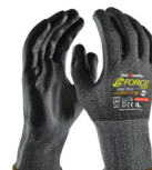
G-Force Cut C Micro-Foam NBR Glove GKH197