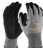
G-Force Ultra C3 Cut Resistant Glove GKH196