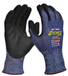
G-Force Ultra C5 Cut Resistant Glove GCF178