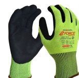
G-Force Hi-Vis Cut C Glove with Nitrile Palm GTH238