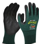
G-Force Ultra C3 Cut Resistant Glove GCT177